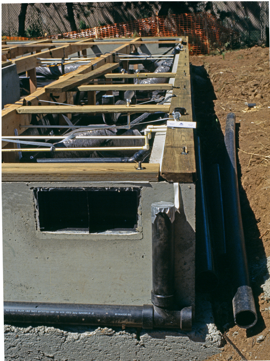
Pacific A 1