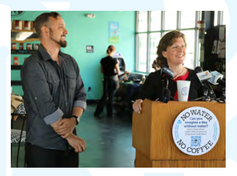
▲ Syracuse Mayor Stephanie Miner speaks at an Imagine a Day Without Water event.