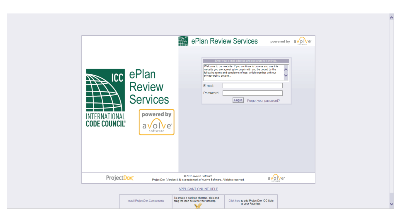
To submit drawings to ICC for plan review, applicants log in to ProjectDox.

Dominic Sims, CEO of ICC, adds, "Leveraging the speed of the cloud to transfer docu-