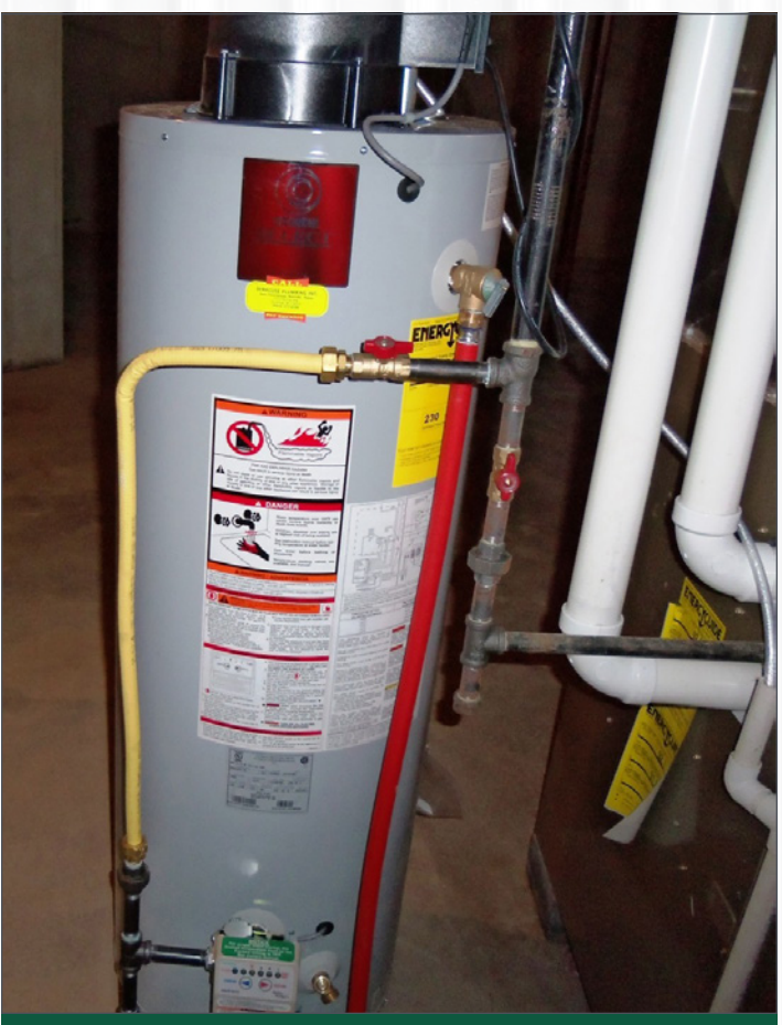
Example of Multi-piping Material System

All new CSST systems must be bonded regardless of whether the systems include only CSST or include other piping materials (steel pipe or copper pipe/tubing) in combination with CSST. Existing non-CSST piping systems must be bonded when CSST is added to the system regardless of the length of CSST added.