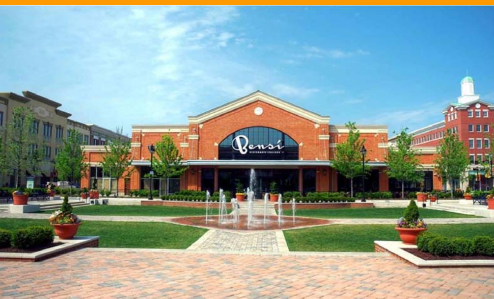
The Bensi restaurant was one of many architectural plans evaluated by ICC Plan Review Services to ensure compliance with Virginia code specifications.

2010, incorporates four blocks of modern urban food, fun, office and living space.