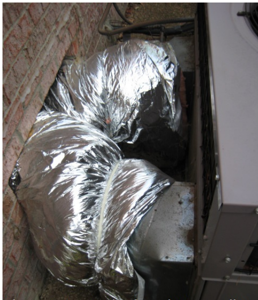
The opening in the foundation wall is not wide enough for the HVAC unit.

Three (3) photos are attached to this proposal form. (photos were taken at my residence, after rain hood was removed from the HVAC unit)