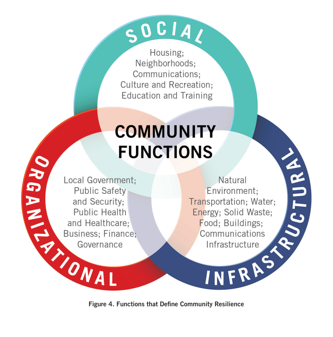
Figure 4. Functions that Define Community Resilience

Communities act as systems. A community is only as resilient as its weakest link (ANCR 2018). The Alliance for National & Community Resilience (ANCR) has identified 19 functions that contribute to a community and its resilience (See Figure 4). Identifying strategies that support the resilience of multiple community functions or help address other community priorities including energy efficiency can help reduce the overall cost of implementation and satisfy diverse stakeholder groups. Such an approach recognizes the potential for co-benefits and leverages potential synergies.