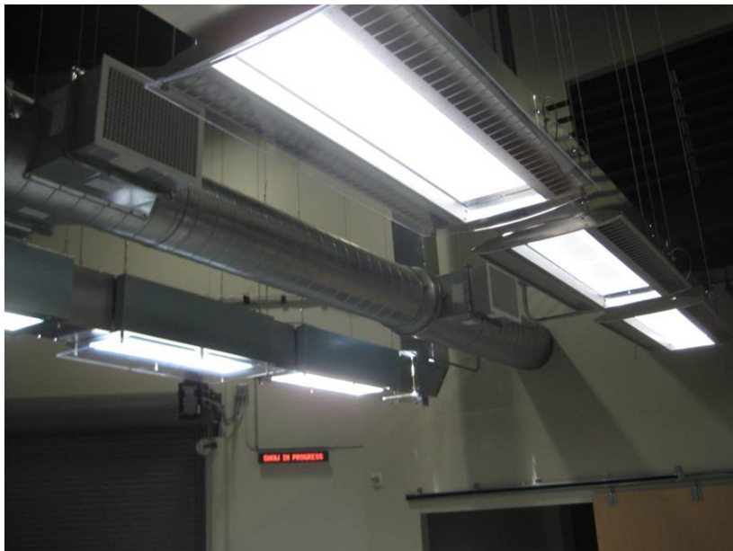
Reflective duct (the two ducts on the outside) in an open ceiling alongside a traditional HVAC duct.

The language used to create the new Section 608.1 was adapted from Section 603 of the 2012 International Mechanical Code. The definition for reflective duct was adapted from the definition of duct found in the 2012 International Mechanical Code.