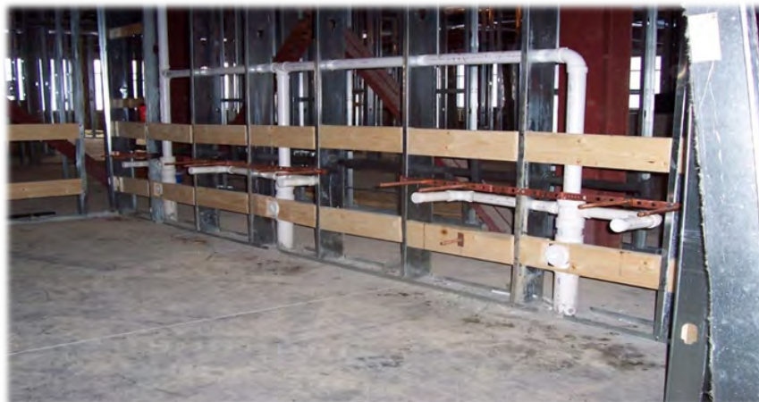
Photo of a typical multiple lavatory rough-in

In 2018, code provisions were added to the IPC (Section 403.1.2) and IBC to allow toilet fixtures located in a single-user toilet facility to be counted toward the total number of fixtures required for an occupancy, despite their designation by sex or family. In 2021, Section 403.1.1 Exception 3 was added to clarify how toilet facilities that are configured to allow use by either sex can also be used. Where a building is designed to have single-user toilet facilities, and the male and female fixture ratios in Table 403.1 are identical, the distribution of sexes is not required. However, where different table ratios are indicated, the calculations will require adjustment to accommodate the difference. This is basically saying that the intent of these changes is not to reduce the total quantity of plumbing fixtures required for a building.