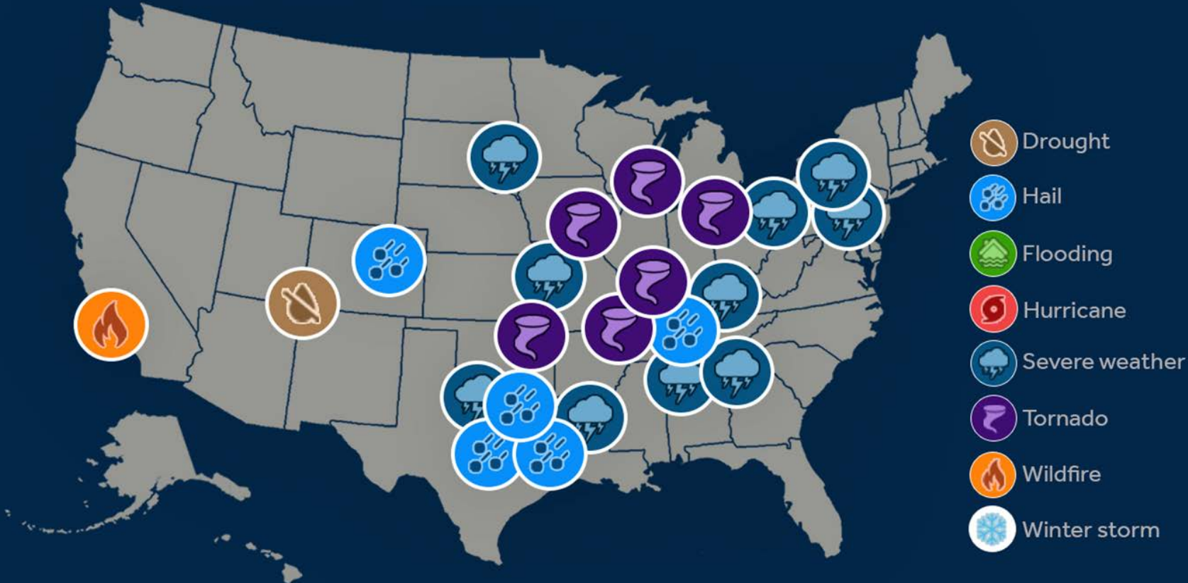
Approximate location of the 23 billion-dollar weather and climate disasters (CPI-adjusted) that impacted the U.S. from January-December of 2025. Data as of December 31, 2025.