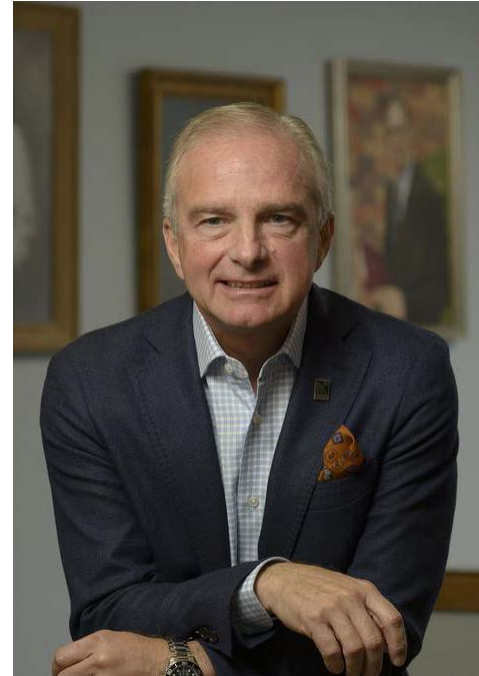
Dominic Sims, CEO International Code Council