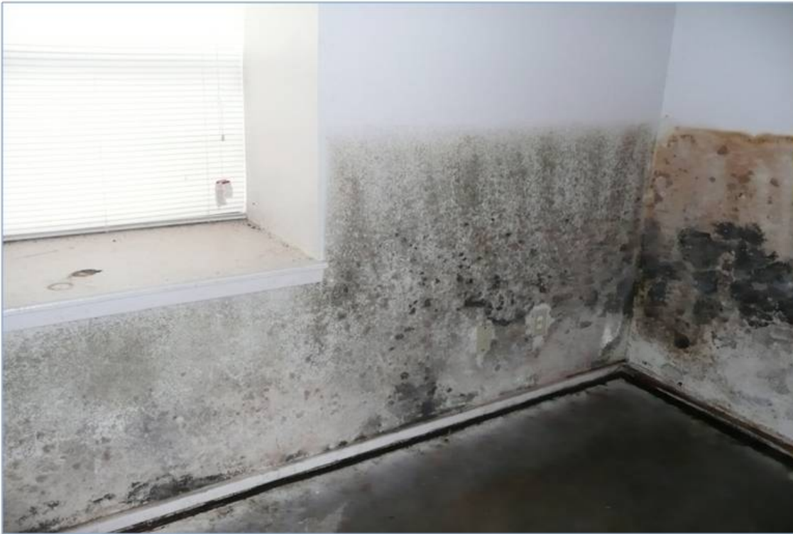
Figure. Interior Condition at Kristie Manor Apartments at time of Demolition Order and Substantial Damage Declaration. The buildings had flooded multiple times, each time experiencing further deterioration. Note the high water mark and mold. Had the apartment buildings been repaired without bringing it into compliance with the flood requirements, the structures and occupants would have remained at risk for this sort of damaging and life-threatening flooding due to their location in a floodway.

Bibliography: Substantial Improvement/Substantial Damage Desk Reference, FEMA P-758. Federal Emergency Management Agency. 2010. http://www.fema.gov/library/viewRecord.do?id=4160