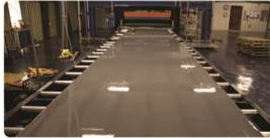
Extrusion line at the Monticello, Florida factory.

SecureFLX is designed to be safer and physically outperform every other drain pan at a superior price point.