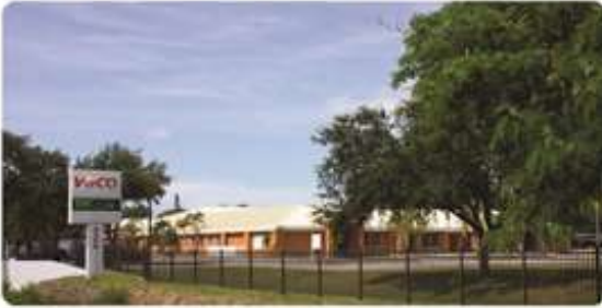
VizCO Corporate office in Bradenton, Florida.