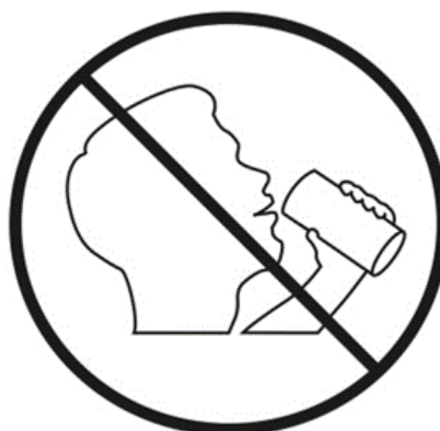
FIGURE P3401.3 PICTOGRAPH—DO NOT DRINK

P3401.3 Signage required. Where nonpotable water is supplied to outlets such as hose connections, hydrants, open-ended pipes and faucets each outlet shall be identified at the point of use with signage that reads as follows: “CAUTION: NONPOTABLE WATER – DO NOT DRINK.” The words shall be legibly and indelibly printed on a tag or sign constructed of corrosion-resistant waterproof material or shall be indelibly printed on the fixture. The letters of the words shall be not less than 0.5 inch (12.7 mm) in height and in colors in contrast to the background on which they are applied. In addition to the required text, the pictograph shown in Figure P3401.3 shall appear on the signage required by this section.