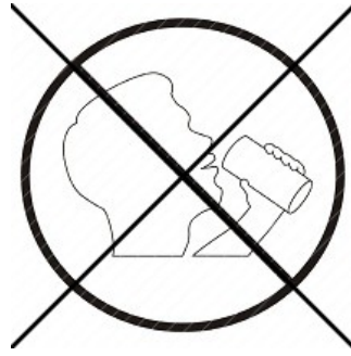
FIGURE P2910.3 PICTOGRAPH—DO NOT DRINK