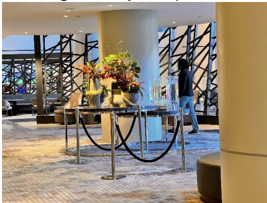
Table at 36” height with 3” high bottom rail.

Following are many examples that do work that would not meet the current requirements.