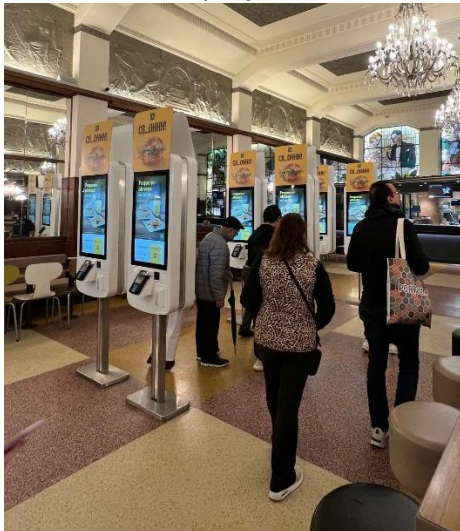
Order kiosks with 2" high bottom plates