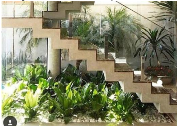
Garden under stairway