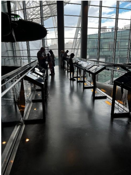
Accessible displays with 4" side bottom rails.