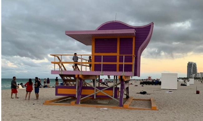
Beach lifeguard station overhang on beam platform.