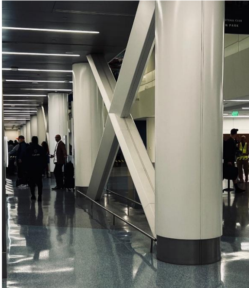
4" high barriers for truss systems to the side of the circulation path