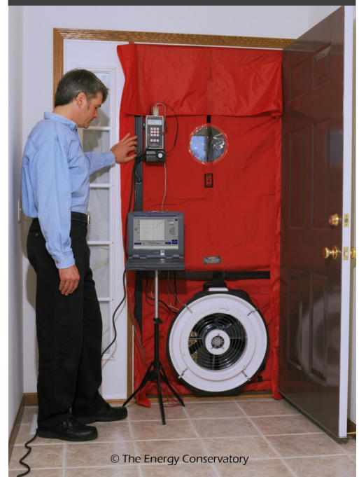
Blower Door Test