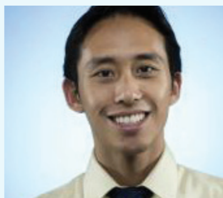
RONG-GONG LIN II Staff Writer Specializing in Earthquake Safety Issues, L.A. Times